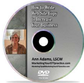
How to Write Web Site Copy to Increase Your Business – Did you know you have less than 7 seconds to keep someone on your web site. This DVD is packed full of the critical concepts that need to be in all effective copy.