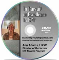
In Pursuit of Excellence – Working with others is about more than just creating a setup and tapping. This DVD shares concepts and ideas necessary for successful EFT sessions that all EFTers can find useful.